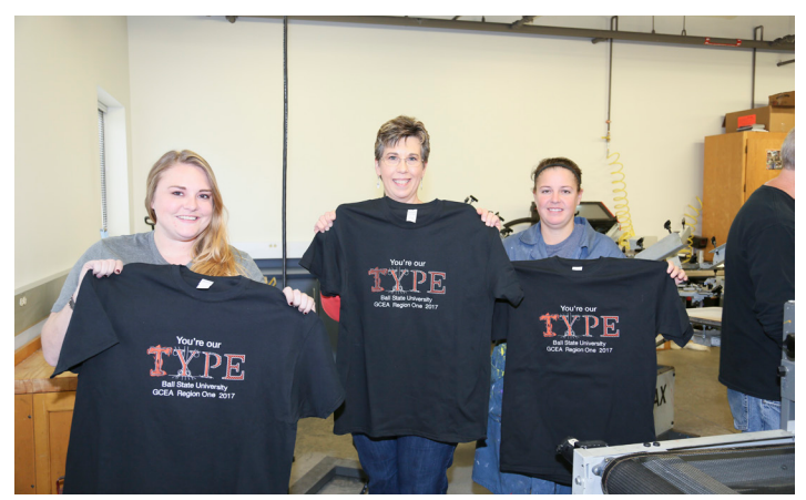
Conference attendees show off shirts made with discharge screen inks.