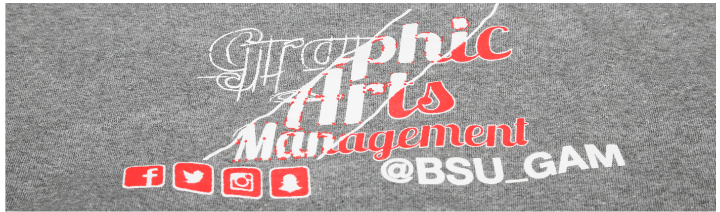
The Region 1 conference for GCEA was held November 3 and 4 at Ball State University in Muncie, IN.